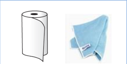
Use your cleaning tools

Please reference the relevant Safety Data Sheets, risk assessment and safe system at work documents.