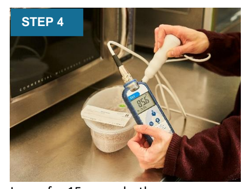
Leave for 15 seconds, then temperature probe the jacket potato. If above 82°C, record the temperature. If below, use the 30 second boost (Button 0). Temperature probe again. If still below 82°C dispose of meal and replace with new.