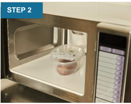
Place the jacket potato in the microwave. DO NOT PUT THE PLATE INTO THE MICROWAVE.