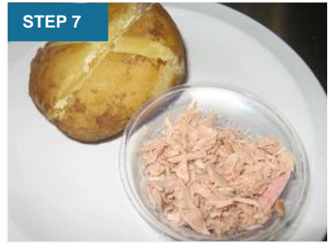
Add potato filling and side salad onto the plate if ordered.