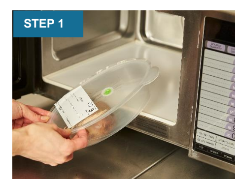
Look to check that the seal and valve are intact, and the jacket potato is in date.