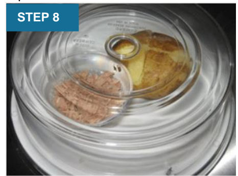
Cover with a plate lid and serve.