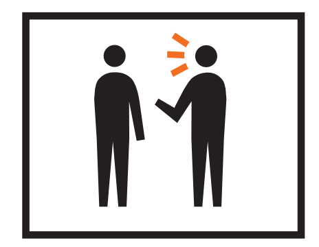
SPEAK OUT if you have any safety concerns