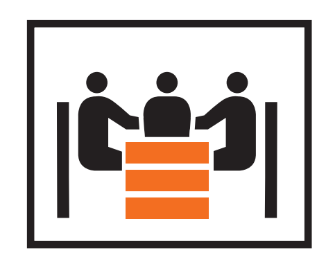
GET INVOLVED and talk about safety issues