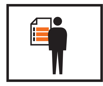
FOLLOW RULES to keep you and others safe

This Safety Conversation focuses on preventing cut injuries, predominantly when working with knives. You will learn about the main causes of cut injuries in our business and understand how to prevent them. Taking part in this session will help you demonstrate good safety behaviours by: